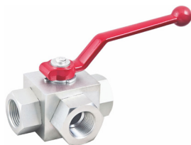
3-WAY L TYPE